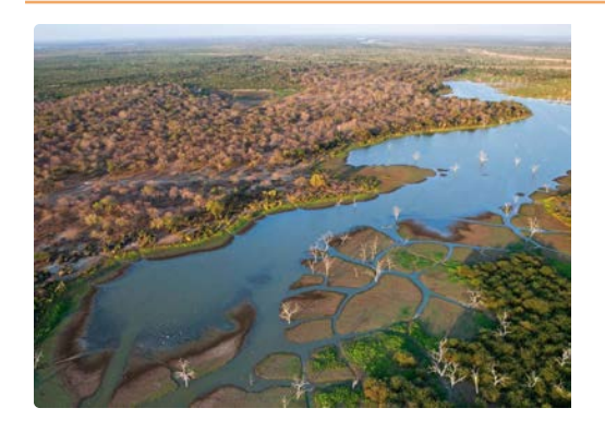
Day 5 Delta Adventures Await

Depending on the day's schedule, rise early for a sunrise walk, a game drive, or a canoe excursion through the Delta's waterways. Experience the thrill of a night game drive, observing the unique behaviors of nocturnal animals in their natural habitat. Share stories and laughter with fellow adventurers over dinner, reliving the day's surprises and excitement.