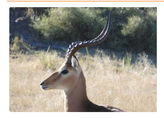
Day 2 Journey to Makgadikgadi Pans

After breakfast, transfer to the airport for your flight to Maun, Botswana. Once there, embark on a scenic 90-minute drive to Meno a Kwena, your intimate camp for the next few days. Settle in and unpack before heading out to explore Makgadikgadi Pans National Park. Marvel at the stunning scenery and search for antelope before enjoying a welcome dinner back at camp, toasting to the adventures that lie ahead.