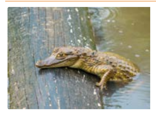
Day 7 Explore Yasuni National Park

Explore the distinct landscapes of Yasuni National Park by vehicle and on foot and witness its kaleidoscopic biodiversity. Proudly introduce your newfound inner naturalist as you identify an array of birds and mammals along the forest trails. The rare chance to interact with local indigenous people here reveals their deep connection with this extraordinary, life-sustaining rainforest.