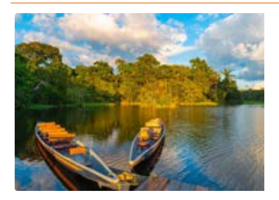
Day 3 Quito to the Amazon Rainforest

Your adventure continues with an eastbound flight to the port town of El Coca on the banks of the Napo River. Spend the next week exploring this major Amazon tributary, the source of all life—and extraordinary biodiversity—enshrined in the pristine Ecuadorian rainforest. Travel by motorized canoe to your jungle lodge, an airy lagoon-side retreat a world away from everything familiar. As darkness approaches, a canoe foray introduces you to resident caiman, owls, bats, and boas.