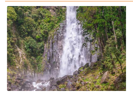
Day 7 Explore Nachi Shrine and Waterfall

Visit Nachi Shrine and the nearby Nachi waterfall, set in a primeval forest with an ancient stone approach. The waterfall, a focus of traditional worship, adds to the spiritual experience. Have lunch at a local café, then enjoy dinner at your hotel.