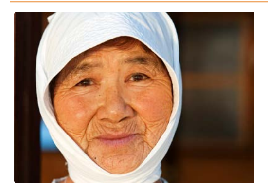
Day 9 Meet an Ama Diver and Travel to Tokyo

Spend the morning with an Ama Diver, learning about her unique profession and enjoying a special seafood lunch. Take regional and bullet trains to Tokyo, where you will dine at a local restaurant.