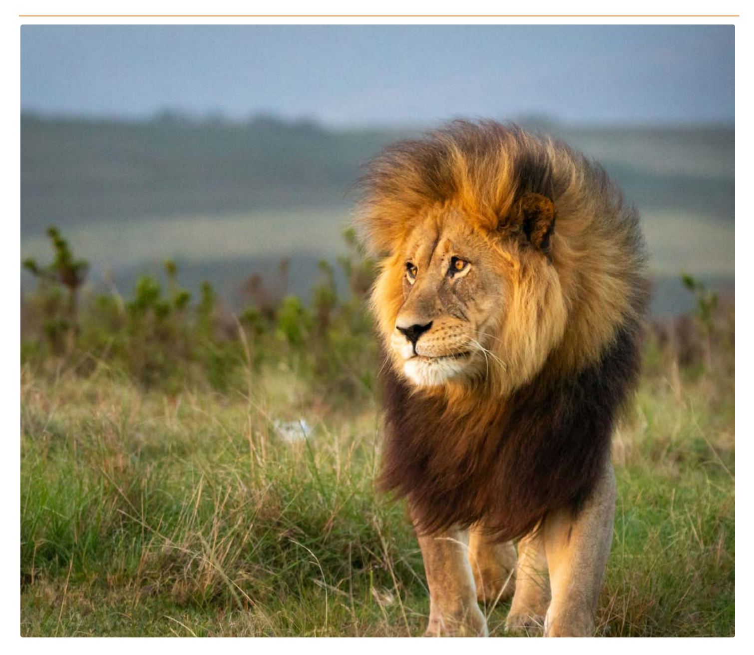
South Africa: Untamed Beauty and African Wilderness