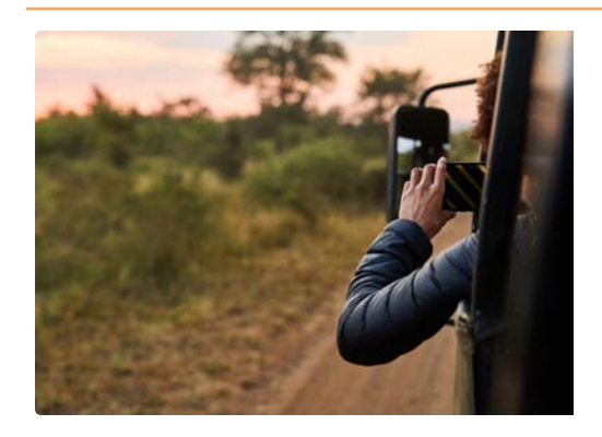
Day 7 Celebrate An Amazing Journey

Another magnificent day of exploration awaits, with expertly guided day and night safaris to encounter the Big Five and other remarkable wildlife in their natural surroundings. Participate in guided bush walks to explore the African wilderness on foot, discovering hidden flora and fauna. Enjoy a farewell dinner with your new AdventureWomen friends, reflecting on cherished memories and celebrating an amazing journey through this remarkable country.