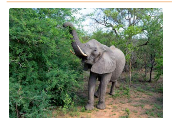
Day 3 Ngala Safari Lodge

Enjoy your first day at Ngala Safari Lodge, where each day begins and ends with thrilling safari adventures. Embark on scheduled game drives and bush walks led by expert guides, encountering the Big Five and other incredible wildlife in their natural habitat. Between game drives, relax and enjoy the lodge's serene amenities. For a unique adventure, the optional Treehouse Experience offers an unforgettable night under the African sky. All meals, refreshments, and drinks are thoughtfully prepared and included, ensuring a delightful culinary experience to complement your safari activities.