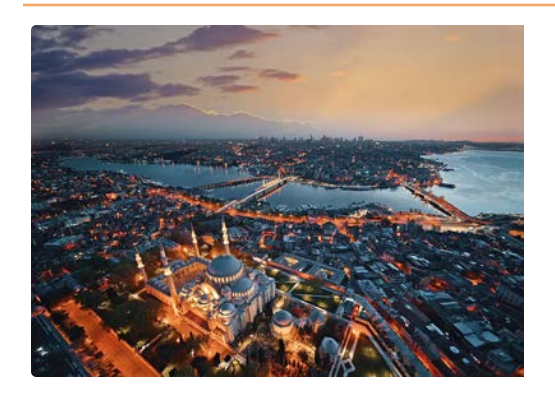
Day 12 Depart Istanbul

After breakfast at the hotel, you'll transfer to the airport for your flight home. The group transfer will be provided when most guests depart (exact time to be determined). Private transfers at other times are available for purchase. Depart Istanbul, Turkey (IST).