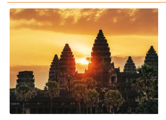
Day 11 Sunrise Splendor at Angkor Wat and Farewell

Enjoy one last morning in Siem Reap before heading to the airport for your flight home. Wake up early to witness the breathtaking sunrise at Angkor Wat, the world's largest religious monument. Explore its majestic architecture and rich history, from its Hindu origins to its current Buddhist role. This temple stands as a pinnacle of classical Khmer architecture, proudly symbolizing Cambodia and even gracing its national flag. After returning to your hotel for a relaxing breakfast and pool time, check out by noon. Enjoy a group transfer to Siem Reap International Airport for your afternoon flight, marking the end of your unforgettable Cambodian adventure.